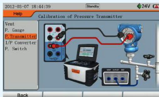
Built-in User's Manual