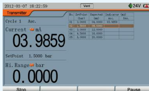
Pressure gauge / transmitter / switch calibration