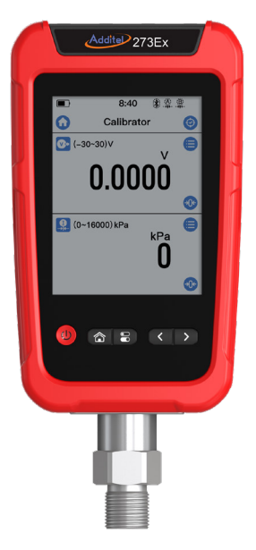
Additel 273Ex and 260Ex with ADT158 pressure module installed