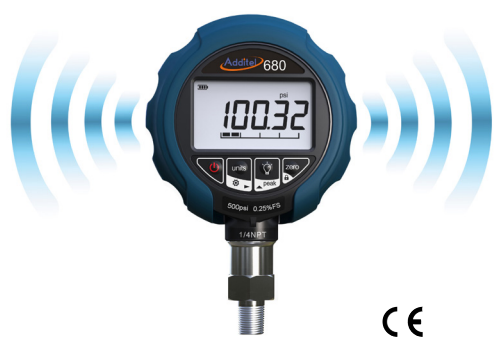
680 with data logging and wireless (optional)